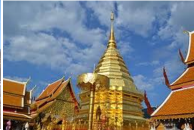
Wat Doi Sutthop Temple