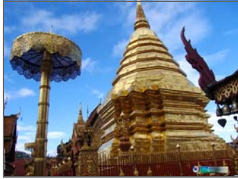
Chiang Mai Temple